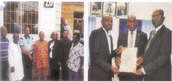
1 st Retirees Forum 2013