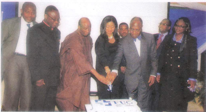
FUG Pensions Brand Launch 2007