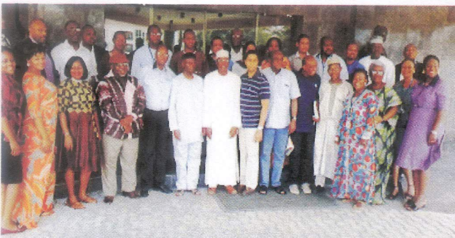
Board and Management Retreat 2017